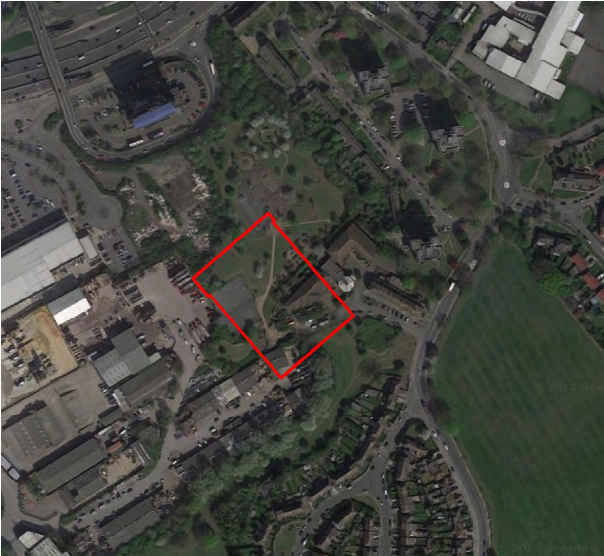
IMAGE 1 - Aerial Photo of Site Boundary